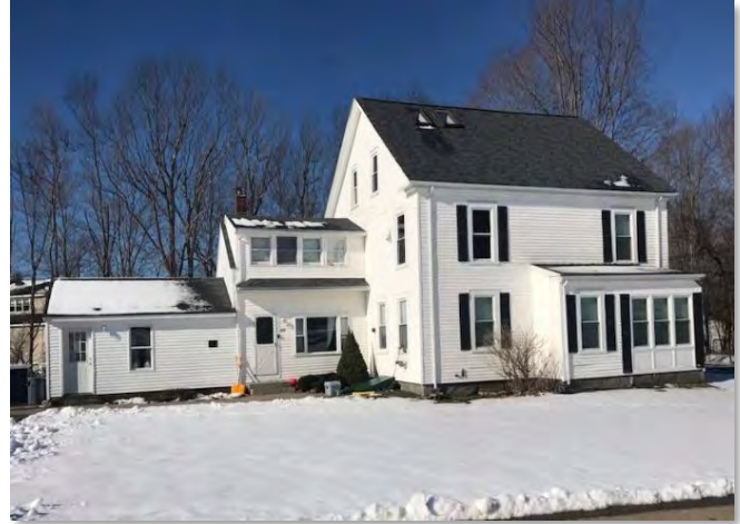
The Joshua House Today