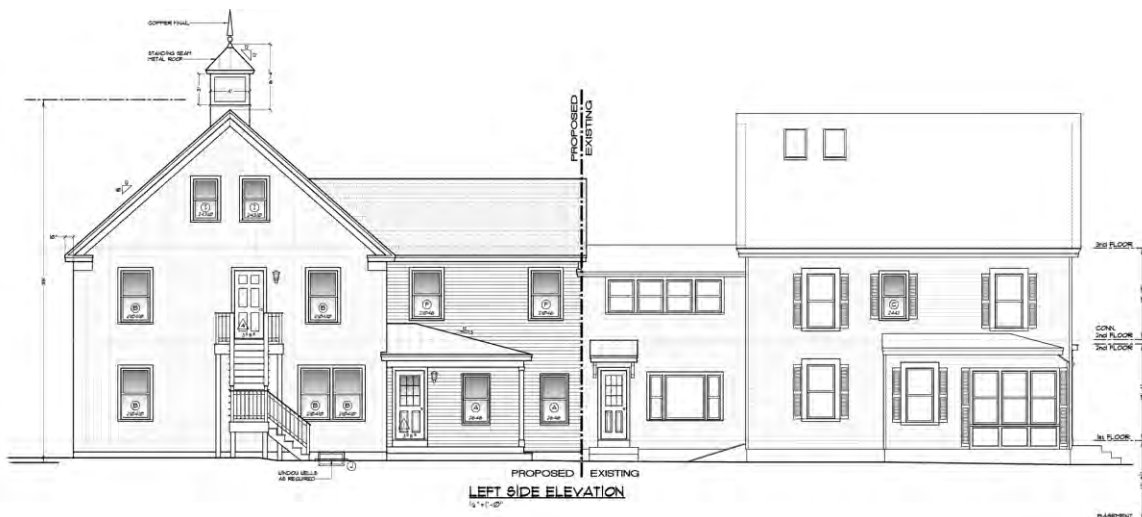
The Joshua House Tomorrow